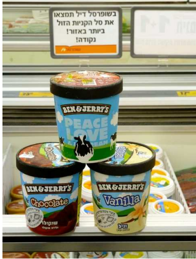
Ice cream on sale in the illegal Israeli settlement of Ma'ale Adumim.